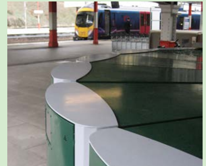
Velo-Safe lockers at Lancaster

Our recently launched locker management service can eliminate the overhead of key management and locker maintenance.