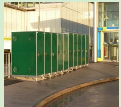
BikeAway Lockers at Liverpool South Parkway