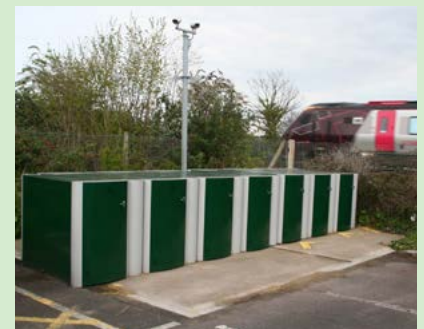
Velo-Safe Lockers at Filton Abbeywood