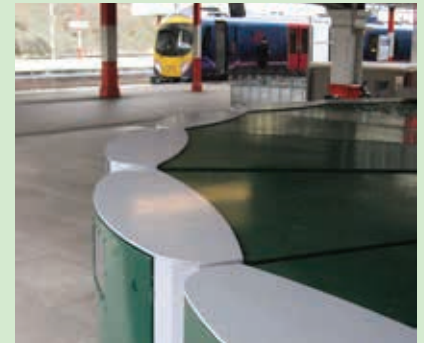
Velo-Safe lockers at Lancaster

Our recently launched locker management service can eliminate the overhead of key management and locker maintenance.