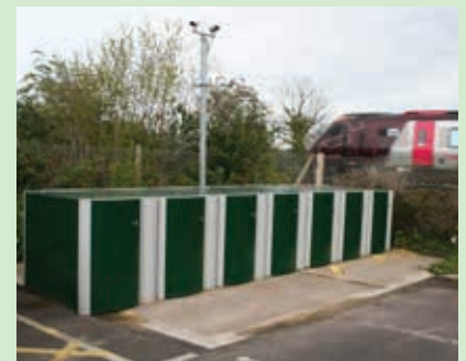
Velo-Safe Lockers at Filton Abbeywood