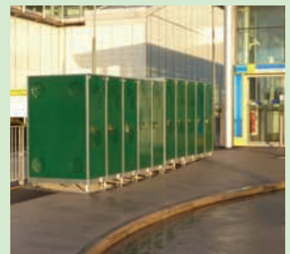
BikeAway Lockers at Liverpool South Parkway