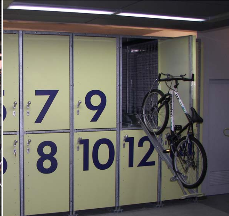
Customised lockers with oversized numbers.