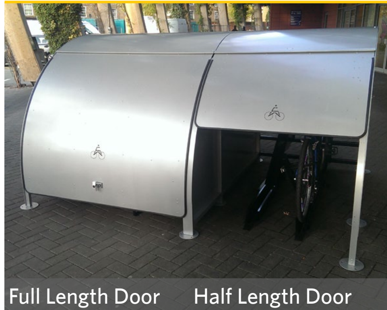
Full Length Door