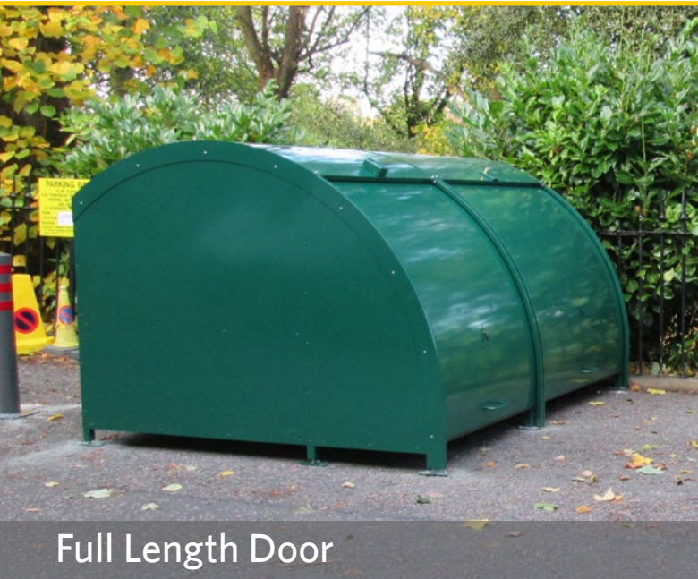
Full Length Door

The door is locked off with a unique and secure internal dead system.