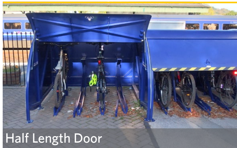
Half Length Door

This product is protected by Registered Designs registered in the European Community