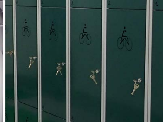
Cam lock operation