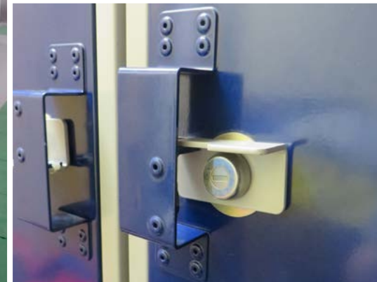
Padlock & master key