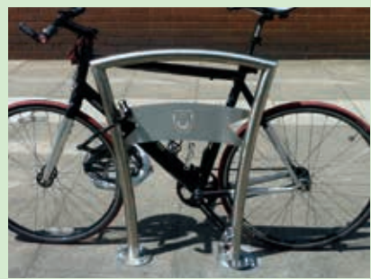
The rack can be embedded or surface mounted for easy installation.