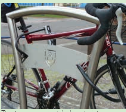
The two convenient locking points encourage effective security.