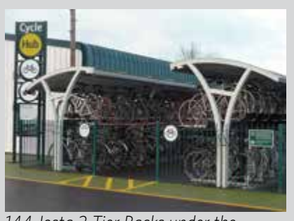
144 Josta 2-Tier Racks under the Cycle-Works Kennet Shelter.