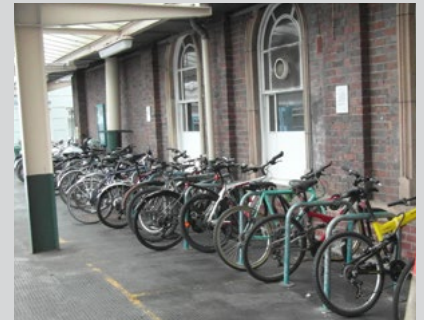
The old low capacity Sheffield racks on the platform.