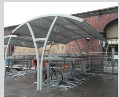
The stylish Kennet shelter covers the double sided Josta 2-tier.