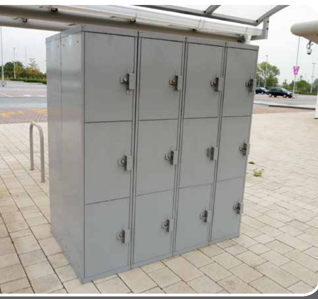
click here for more information