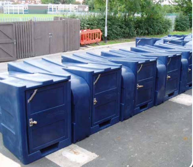
click here for more information