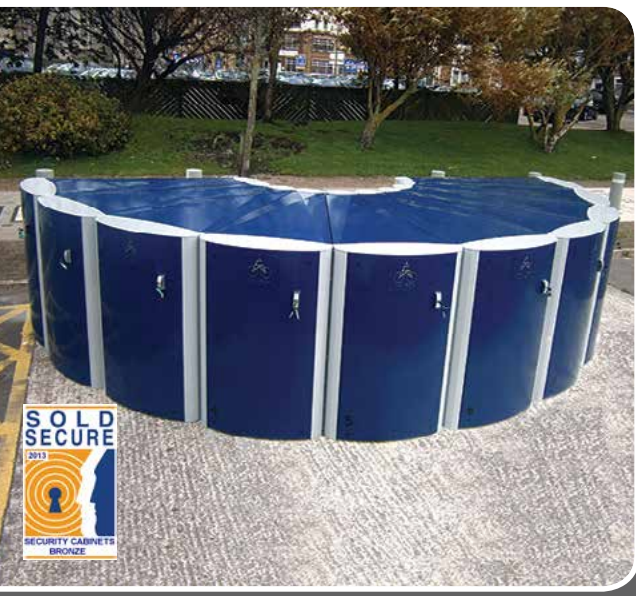
click here for more information