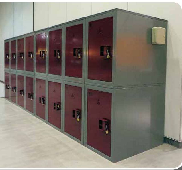
click here for more information