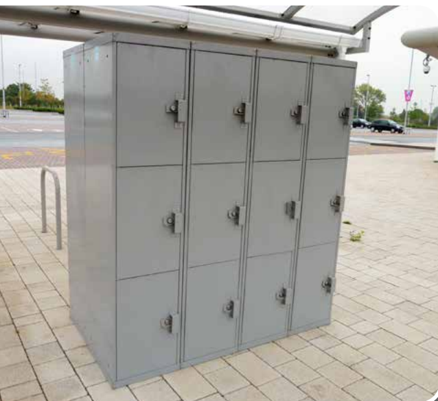
click here for more information