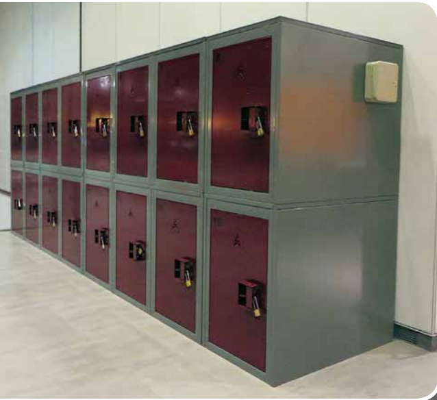
click here for more information