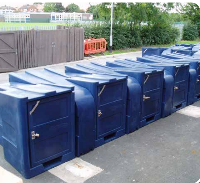
click here for more information