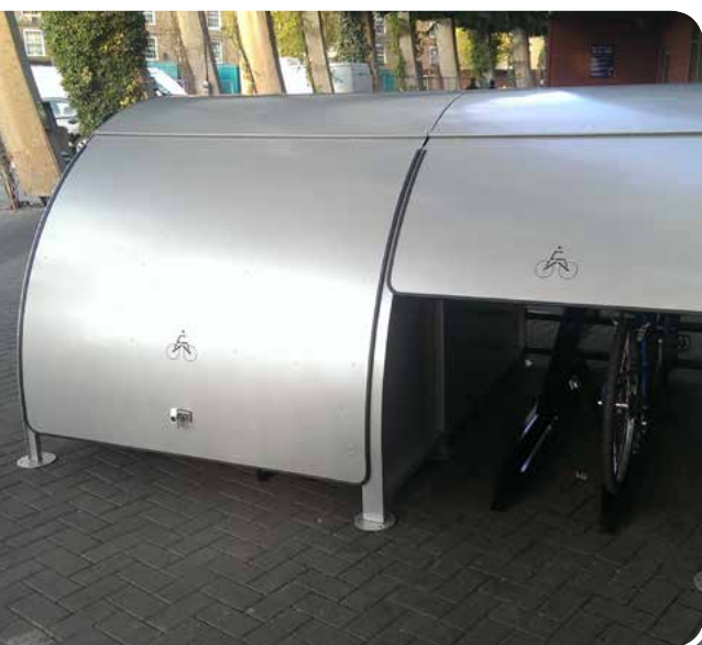
click here for more information