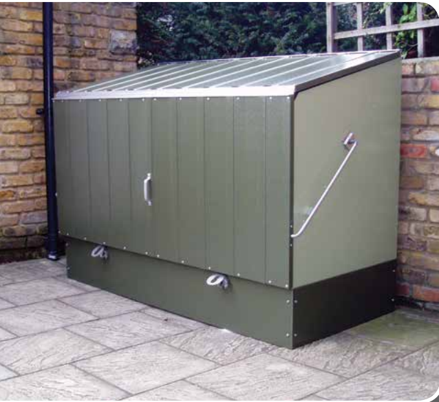
click here for more information