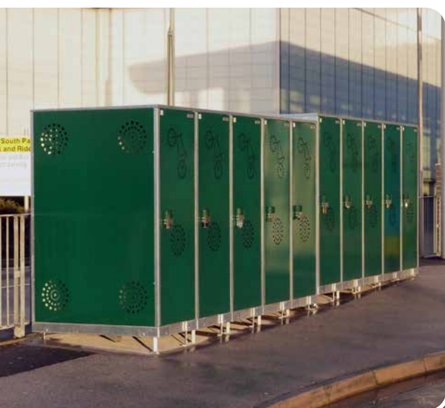
click here for more information