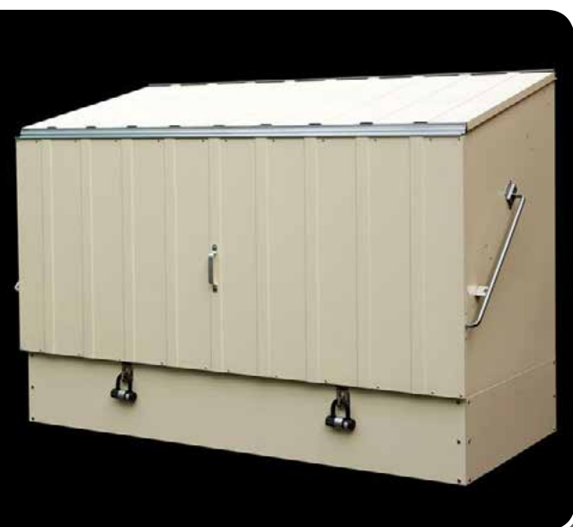
click here for more information