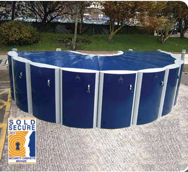
click here for more information