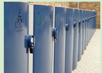
The strong lines of the Velo-Safe complimented the new building.