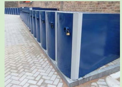
Three banks of six Velo-Safe's were used to overcome the incline in the ground.