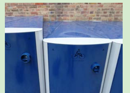
An optional roof plate was included to join adjacent lockers in a smooth row.