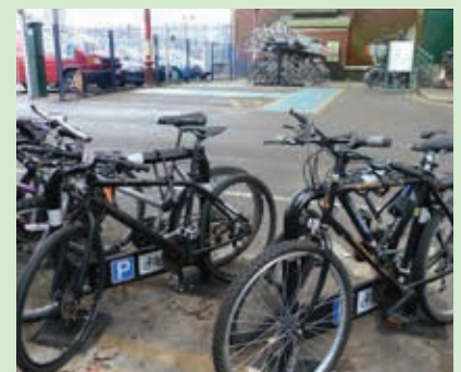
The RidgeRacks design incorporates a ridged top to reduce lock movement