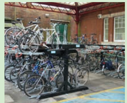
The bike park at Hove