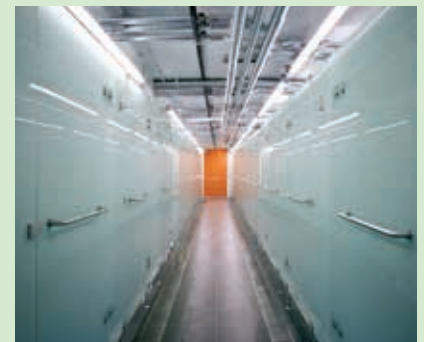
Using contemporary building materials make this shower room stand out.