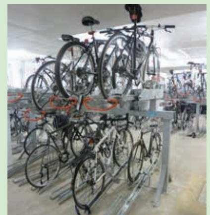
Josta 2-Tier racks in H2