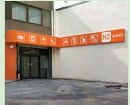
H2 Bike Run - Berwick Street, Soho

The combination of high quality bike parking and other facilities has made it a successful and popular scheme, and one that is a model for other sites wishing to promote cycling in a city center.