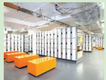
State of the art changing rooms with a modern industrial look.