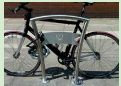
The rack can be embedded or surface mounted for easy installation.