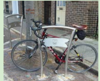
A useful location and layout that is popular with cyclists.

The Lock2Me is manufactured in marine grade stainless steel to resist even the harshest climate. It can be supplied in surface mounted or embedded versions.