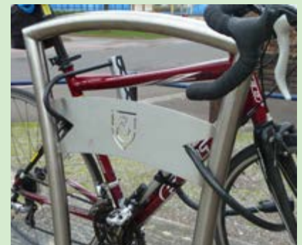
The two convenient locking points encourage effective security.